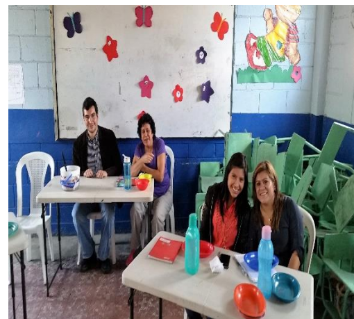
Some of the teachers for the training I did