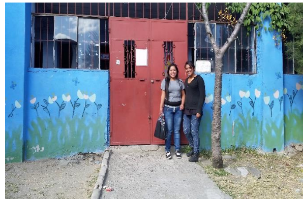
A couple of students in front of school