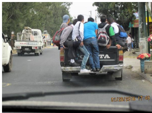
Transportation because of shooting of Van/bus drivers. Lots of traffic in the city.