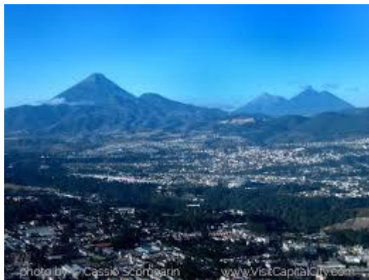
Mountains/volcanoes around the city

Guatemala is a beautiful land of variety. Guatemala City is 5500+ feet elevation in the mountains, as is 2/3 of the country where the temperature is cool and comfortable, to the black sands of San Juan on the Pacific Coast, which is hot and humid. The cities and country side is like a very busy valley surrounded by mountains and volcanoes.