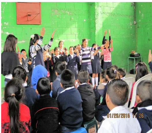
Students on the patio for Bible devotional