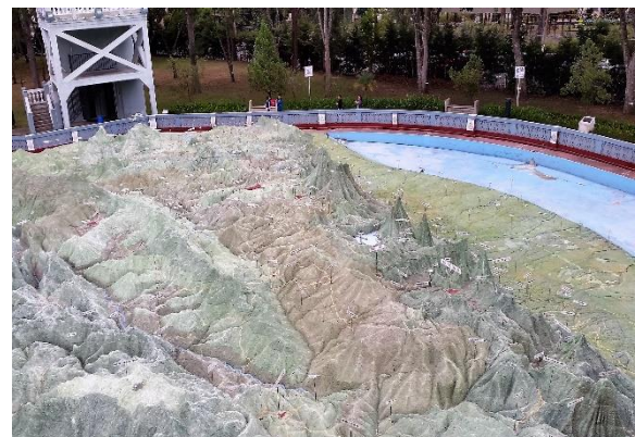
Partial view of topical map of Guatemala